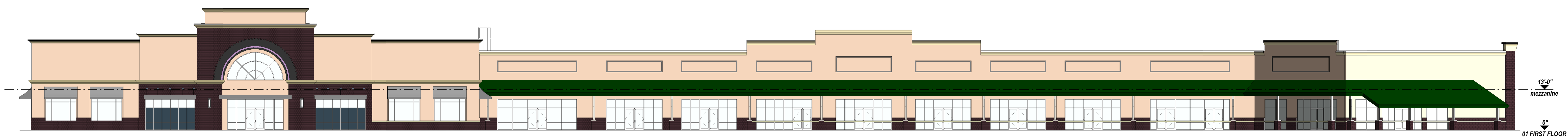
MAIN ELEVATION SCALE: 1/16" = 1'-0" SHEET T-1.1