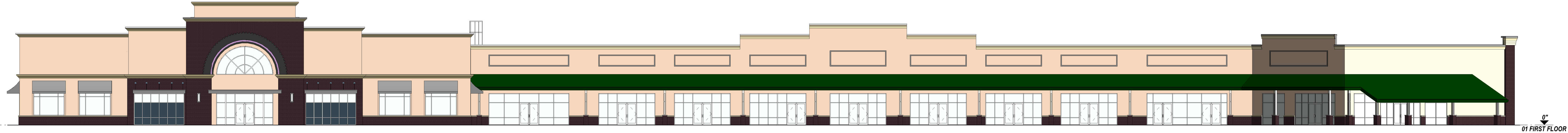
MAIN ELEVATION SCALE: 1/16" = 1'-0" SHEET T-1.1