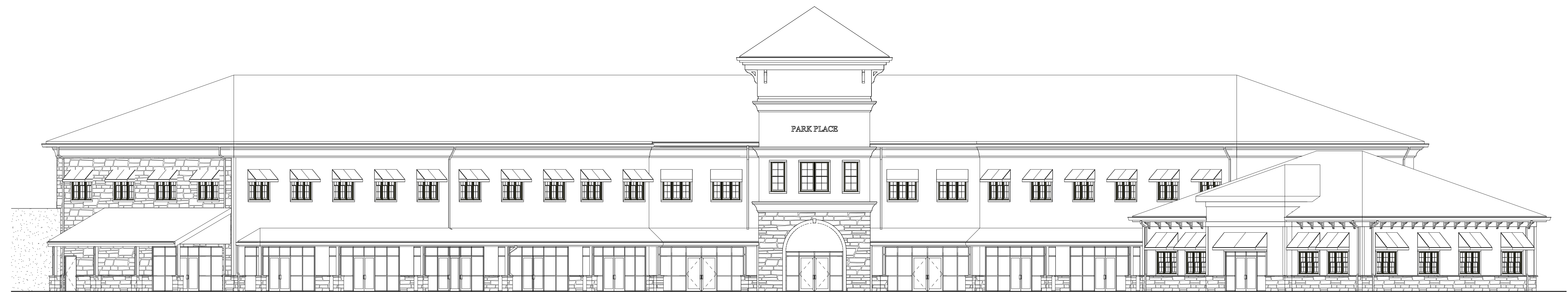
MAIN ELEVATION SCALE 1" = 10'-0"