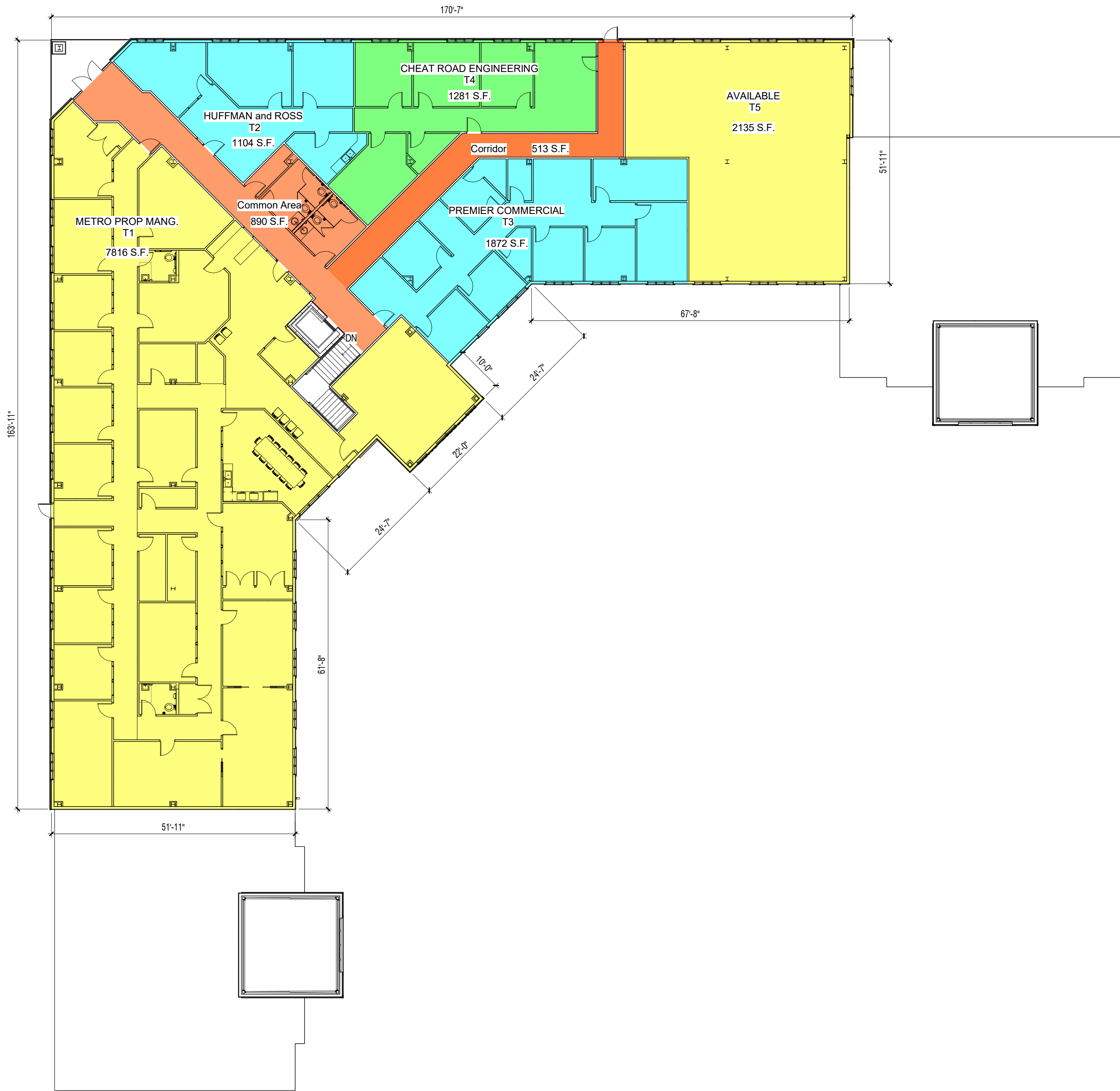
SECOND FLOOR TENANT PLAN SCALE: 1/16" = 1'-0"

FOR LEASE COORDINATION ONLY 12.13.2022 REVISIONS