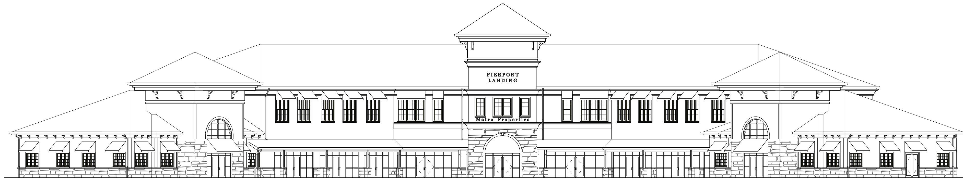
MAIN ELEVATION SCALE: 1/16" = 1'-0"

FOR LEASE COORDINATION ONLY 12.13.2022 REVISIONS